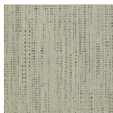
Natural Silk 96111